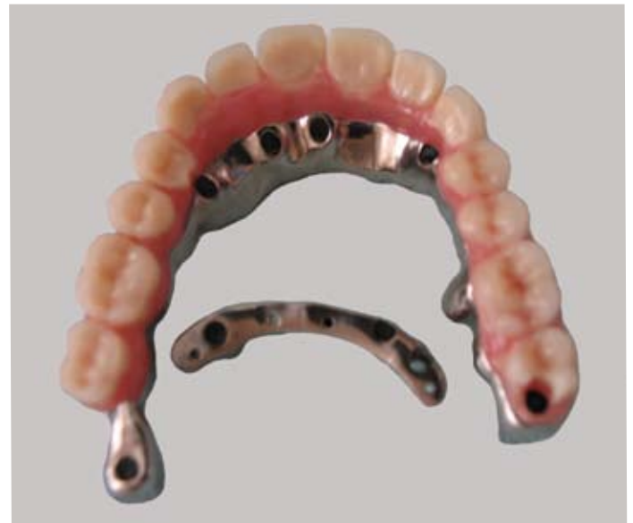
Fixed hybrid bridge with anterior milled bar by Marotta Dental Studio.

The patient returned to my office after approximately three months and the implants were uncovered and