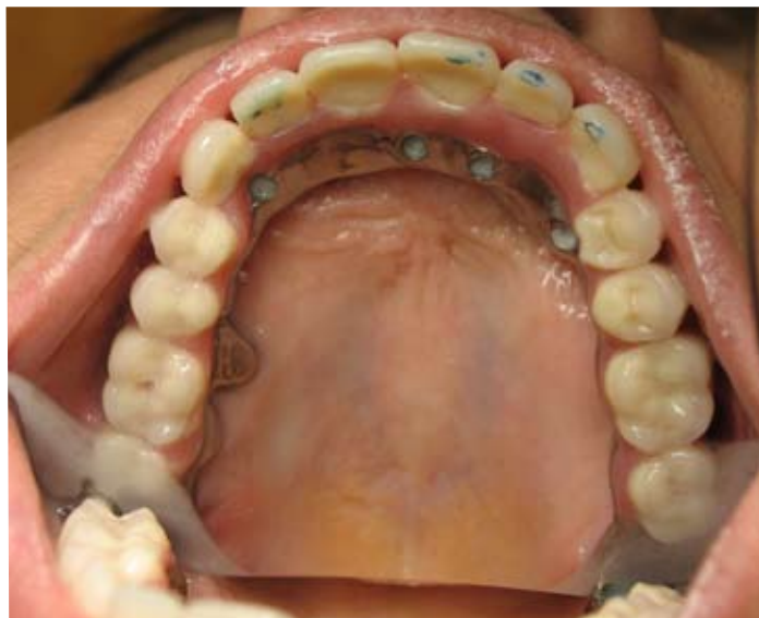
Intraoral view showing four retention screws palatal to anterior teeth.